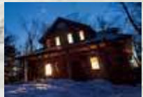
VOYAGEUR QUEST ALGONQUIN LOG CABIN

If you like, please use your GPS to get to South River Ontario. From South River, please refer to the following map. At South River: • Turn onto Ottawa Avenue (right turn from Toronto, left turn from North Bay). • Follow Ottawa Avenue east out of town. It will bend a number of times and you will travel past Swift Canoes, Tracs Outfitters and eventually over a bridge. • Once over the bridge, follow the road approximately 25 minutes (about 17-18km). • Turn left at the Forestry Road sign. The electricity poles also make the left hand turn at the WENDIGO LAKE sign. • Follow the Forestry Road for 5.6 kms past Camp Wendigo to the first left hand turn at Surprise Lake Rd. (this will be 2.3km past Camp Wendigo). There is a Voyageur Quest sign on your left. • Make a left turn onto Surprise Lake Rd. and follow 0.8km to the Algonquin Log Cabin by: • Following road to V - stay left (you will see a VQ sign as well as other cottage signs). • Follow past white cottages – staying left to the Algonquin Log Cabin driveway.