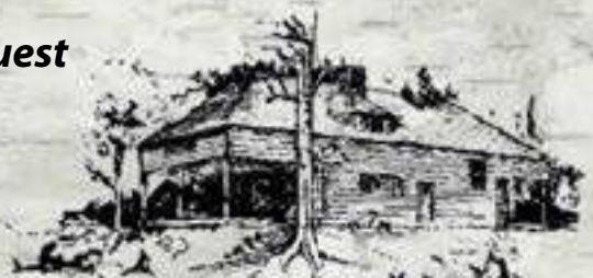
Algonquin Log Cabin